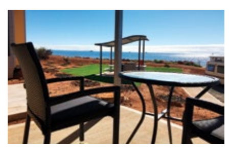
Explore the beauty of the Pilbara