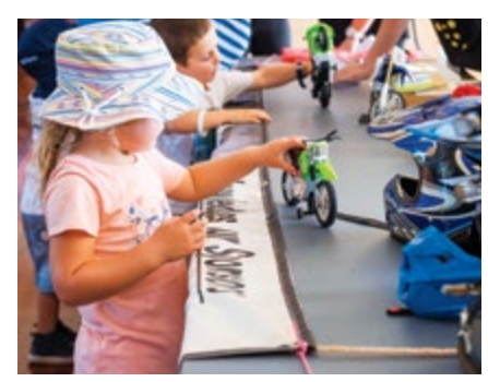
Giving it a go at the Tour de Tom Price.

Made possible through a partnership between the Shire of Ashburton and Rio Tinto, the recent Give it a Go Day events in Tom Price and Paraburdoo aimed to raise awareness of, and encourage participation in, local sport and activity for people of all abilities.