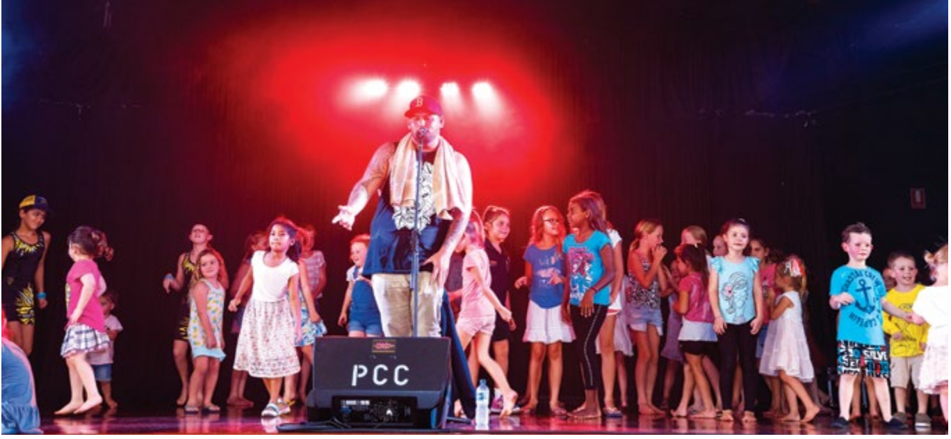
Big T entertained Paraburdoo.