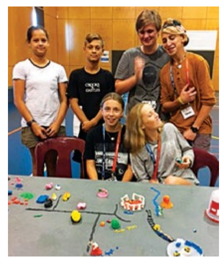
"Youth, The Voice" participants.

A 'Youth, The Voice' workshop will be held in Tom Price, for Paraburdoo and Tom Price Youth, in the coming months so stay tuned for more details.