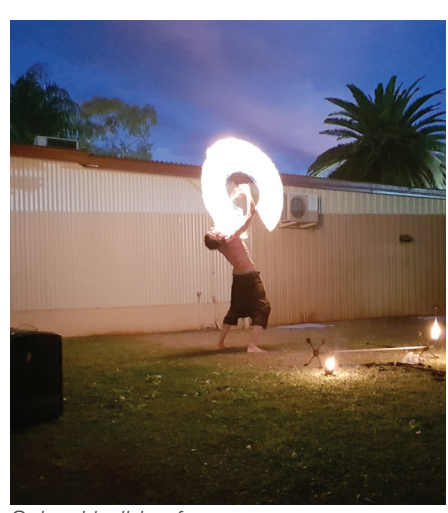
School holiday fun