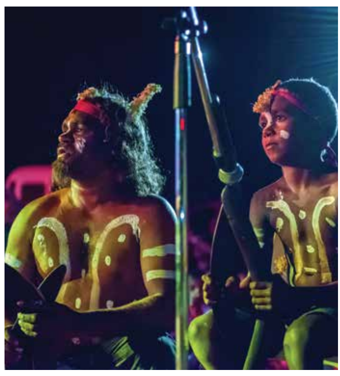
Immerse vourself in culture, connection and country

Tickets are now on sale for this year's Karijini Experience, which the Shire of Ashburton is once again proud to sponsor. Timed to coincide with the school holidays, the 2018 Karijini Experience program extends across six days, from Tuesday April 17 until Sunday April 22, and has lots of opportunity for the whole family to get involved.