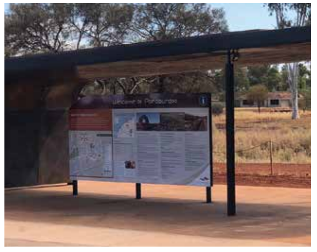
Welcoming tourists to Paraburdoo