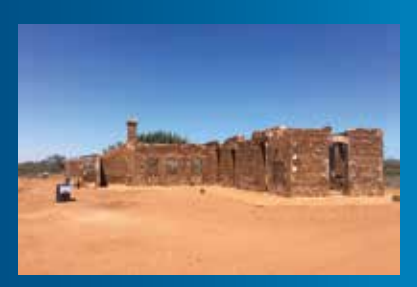
Signs now tell the stories of Old Onslow