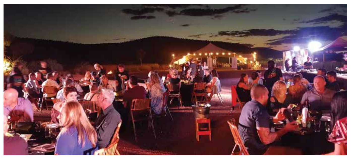
Visitors enjoying the experience of culture, art, music and cuisine