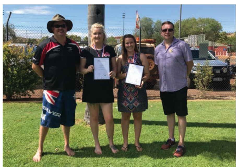
Some of our Citizenship and Sports Star Award Winners