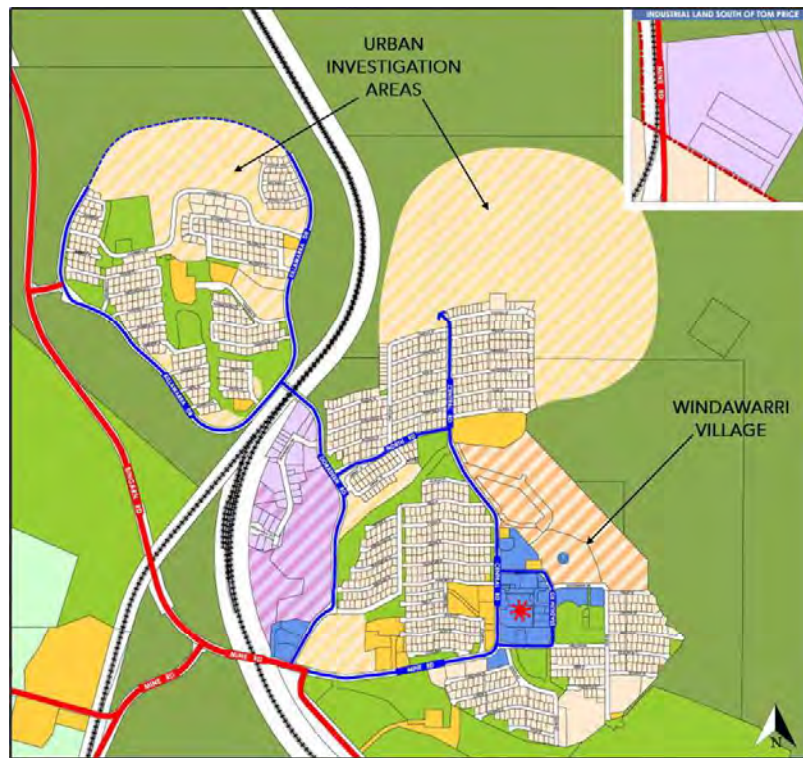
Figure 2 – Extract of Plan 3 Tom Price Town Site Strategy Plan, Local Planning Strategy 2021