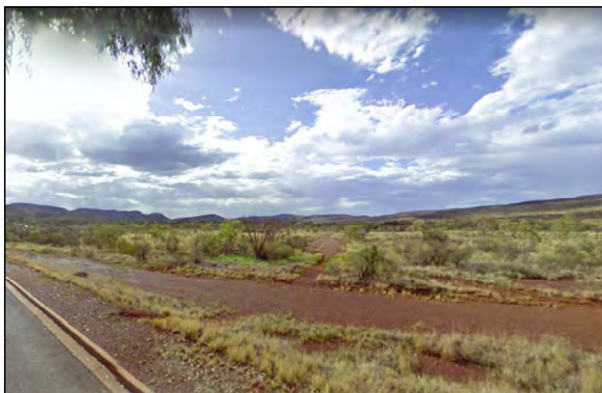
Figures 3 & 4 – Site context of several “urban investigation areas” around Tom Price.

Furthermore, some of Rio Tinto’s housing may be capable of supporting additional dwellings under residential density changes being considered by the Shire’s new local planning scheme, in line with the actions of the Local Planning Strategy. This opportunity has also not been considered by Rio Tinto based on the information provided.