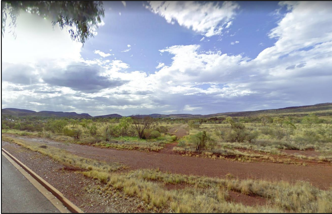
Figures 3 & 4 – Site context of several “urban investigation areas” around Tom Price.

Furthermore, some of Rio Tinto’s housing may be capable of supporting additional dwellings under residential density changes being considered by the Shire’s new local planning scheme, in line with the actions of the Local Planning Strategy. This opportunity has also not been considered by Rio Tinto based on the information provided.