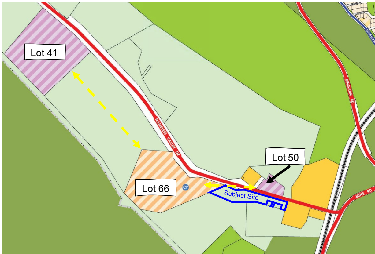
Figure 2: An extract from the Shire of Ashburton Local Planning Strategy, noting the areas supported for industrial development near the proposed site (in blue).