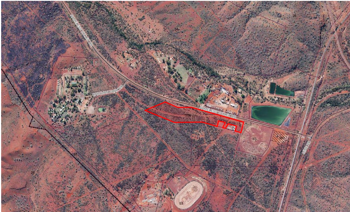
Figure 1: Aerial view of the Lot 500 Nameless Valley Drive and adjoining lots.

Council opposed the proposed sale of Unallocated Crown Land (UCL) within the Tom Price Townsite for Helicopter Operations at the June 2013 Ordinary Meeting of Council. The proposed site was UCL adjacent to Nameless Valley Drive in the vicinity of the road access to Mt Nameless walking track, BMX, and Speedway. An (at the time) unknown proponent proposed helicopter operations from the site however, due to the 'Rural' zoning and proximity to the wastewater treatment plant, it was determined the proposal would negatively impact on residential and tourist amenity at the proposed location.