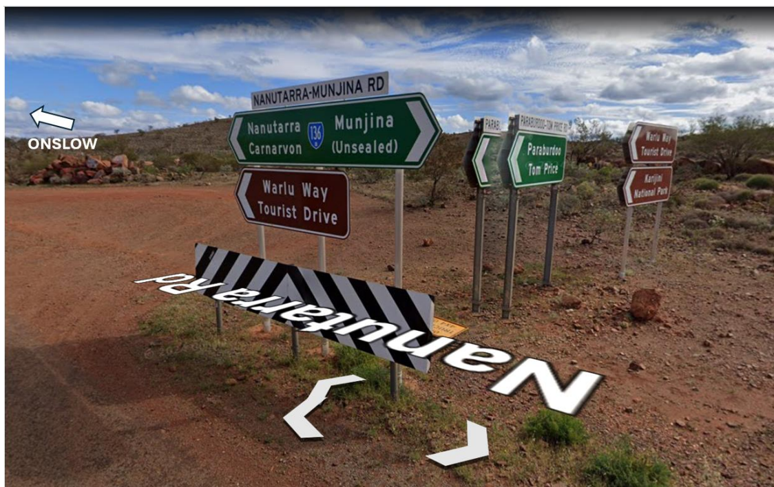
Signage at the intersection of Paraburdoo Road and Nanutarra-Munjina Road