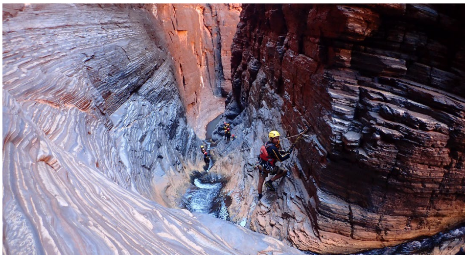
Left: Canyoning in Karijini National Park

From Tom Price you can experience everything that's makes the Pilbara so epic, not just the national parks, but WA's tallest mountains which are waiting to be conquered! Be ready to be amazed by vast red landscapes, the greatest sunrises, and sunsets you'll ever see, not to mention the clearest skies – perfect for stargazing. Tom Price is home of great events like the Karijini Experience (April) and the Nameless Jarndunmunha Festival (August). It's definitely the best home base for adventure!