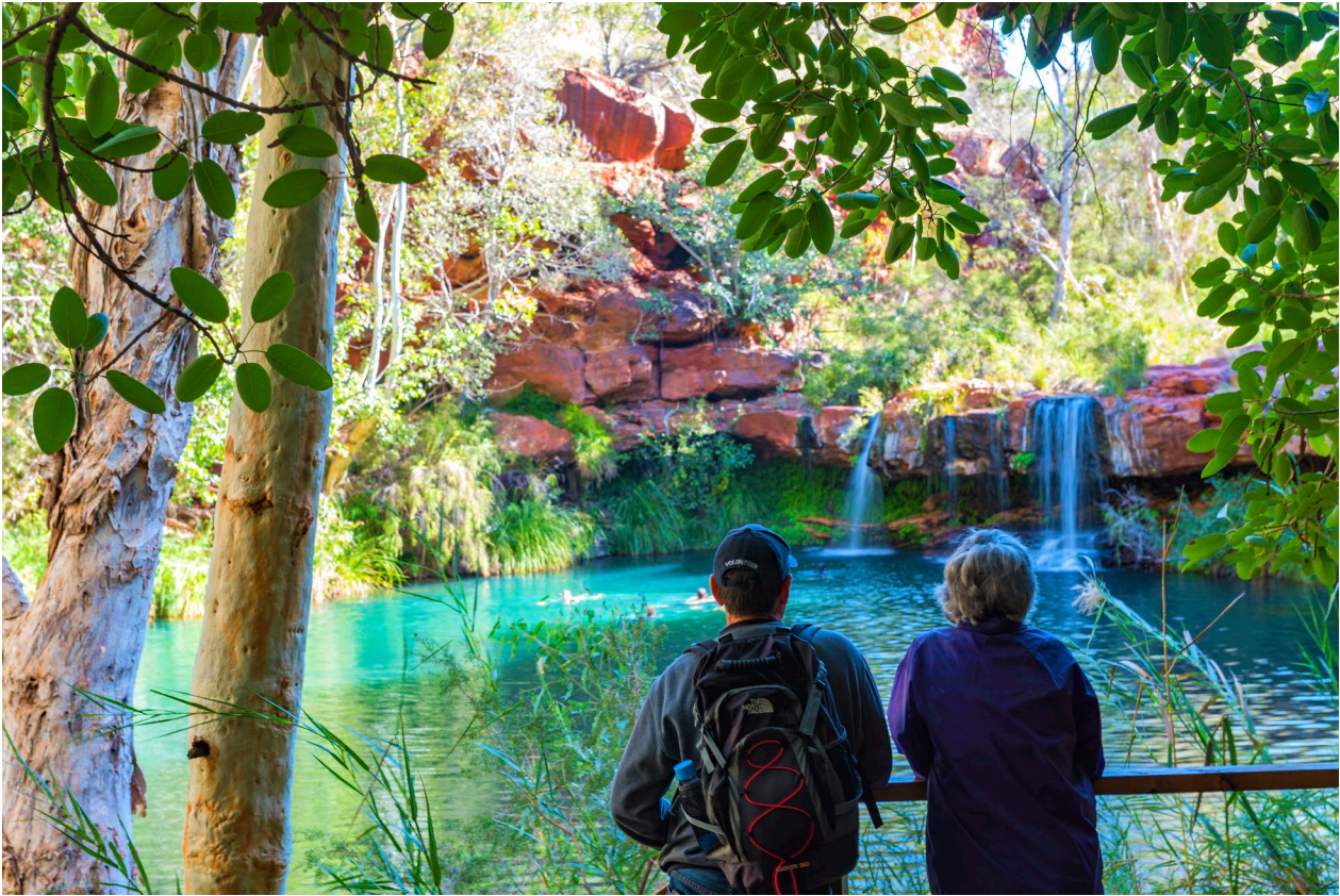
Above: Fern Pool, Karijini National Park

who took him to Dampier. The nickname “Red Dog” has been attributed to the red dirt of the Pilbara.