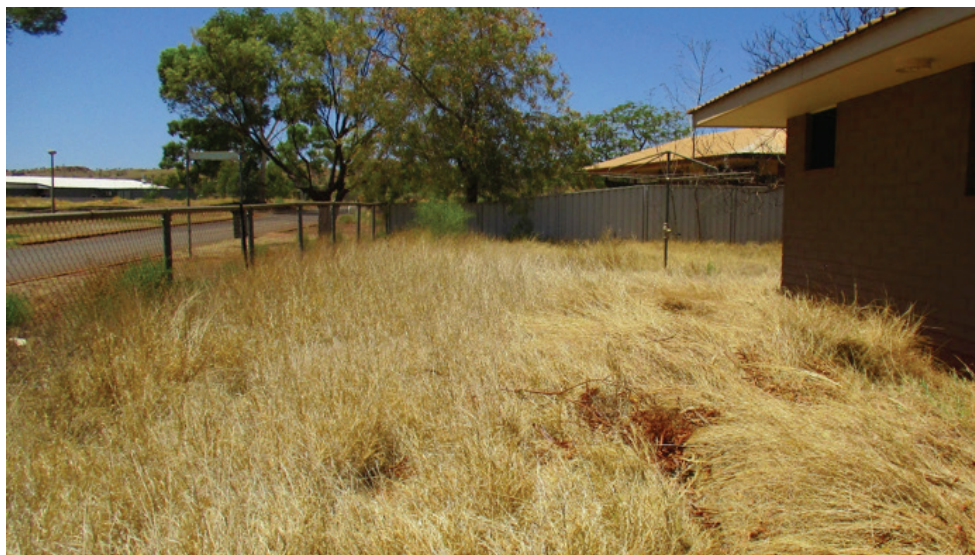
Non-Compliant Residential Property