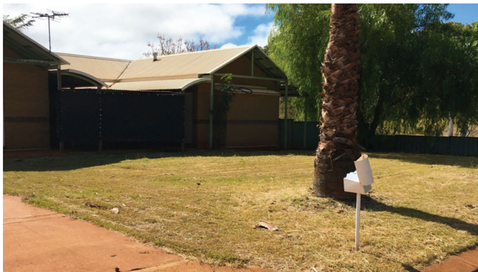
Compliant Residential Property