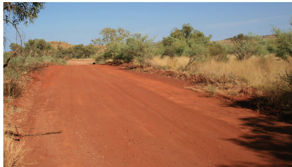
Compliant Mineral Earth Break