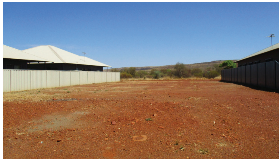
Compliant Vacant Land