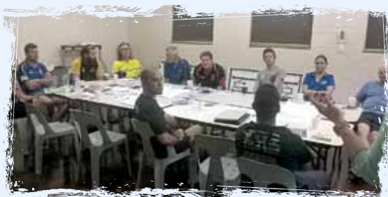
Paraburdoo steering group committee.

Formal training is also offered to clubs and groups who participate in the Inclusive program. The training focuses on how to welcome and accommodate those that are marginalised or have a disability so that they may participate in the club even if it isn't by playing the sport. Being an inclusive club can give groups and clubs greater access to funding, expand their volunteer base and improve club culture.