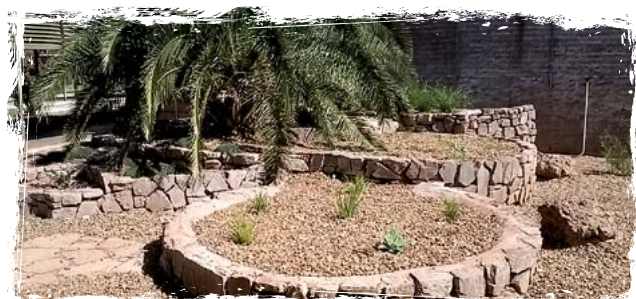
Garden beds transformed by new plants.