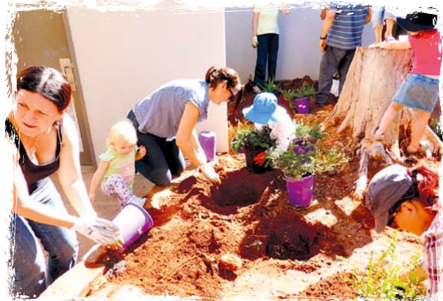
The community get their hands dirty to beautify our gardens.

Throughout the morning, volunteers planted 16 shrubs and 66 ground covers. When all works were finished, volunteers enjoyed a scrumptious brunch supplied as a thank you for their efforts.