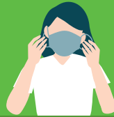
Wearing well-fitted masks over mouth and nose