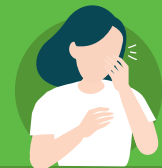
Covering coughs and sneezes