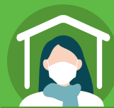
Staying home when unwell