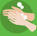
Frequent hand washing with soap, or using hand sanitiser