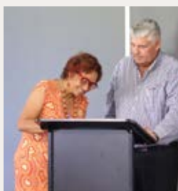
President Smith Swearing in Ceremony

This activity meets Strategic Objective 4 of the Strategic Community Plan – Performance